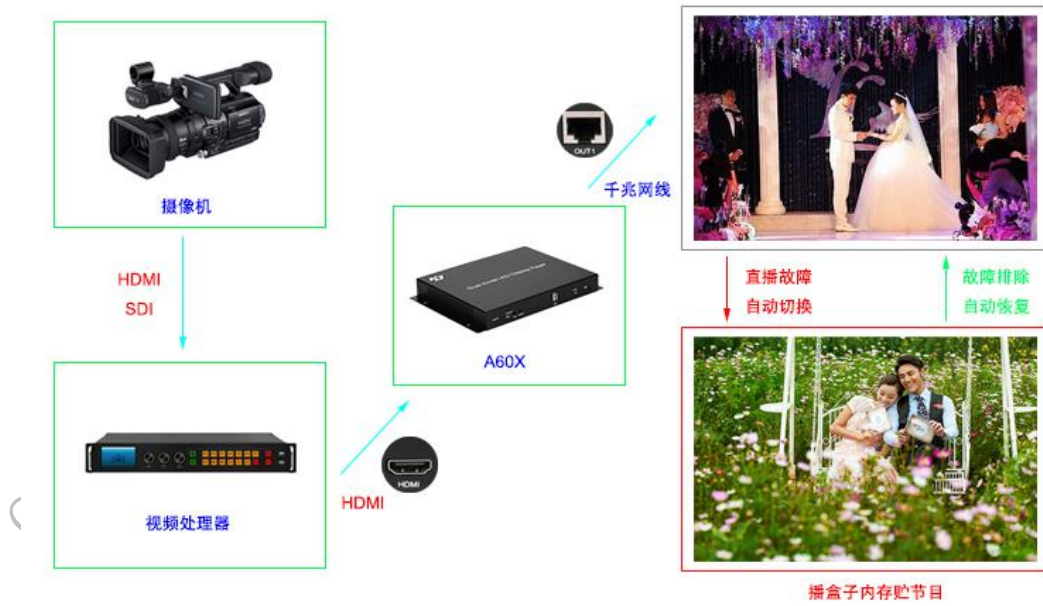
Display camera images synchronously