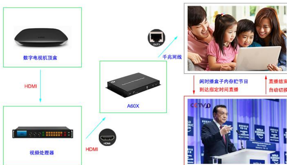
Synchronous display of set-top box screen