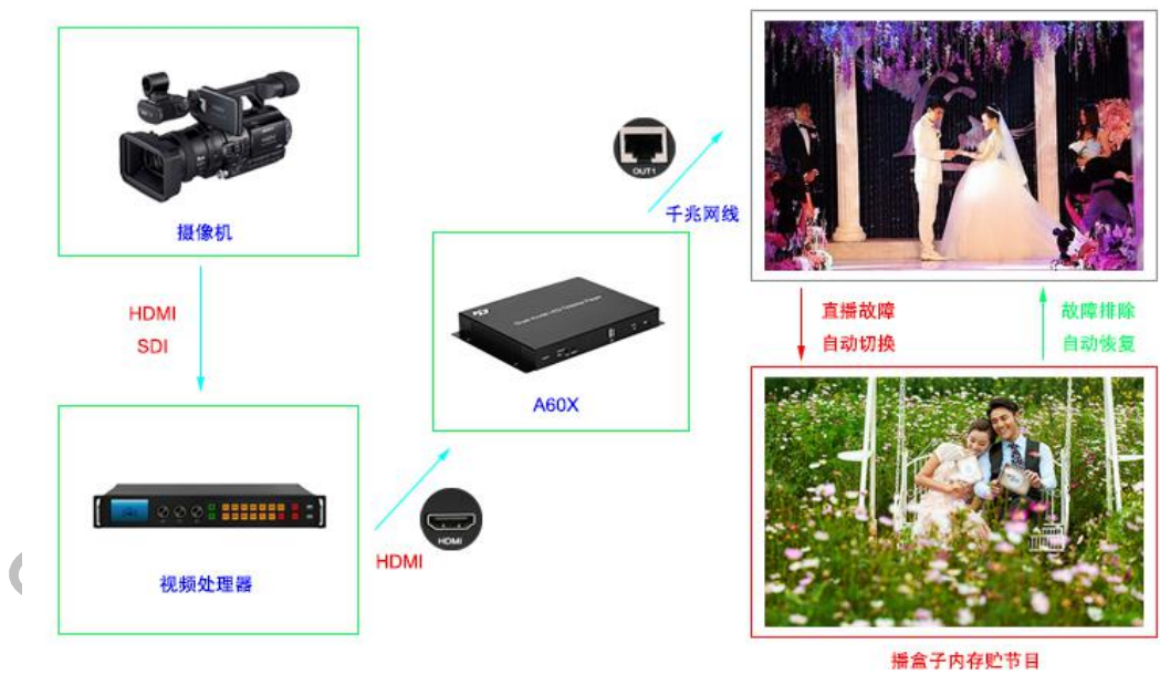
Simultaneous display of camera screen